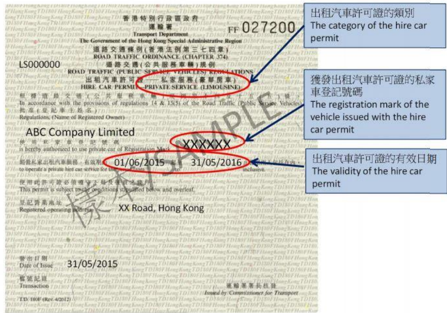
Exhibit 2: Hire Car Permit – Private Service (Limousine)